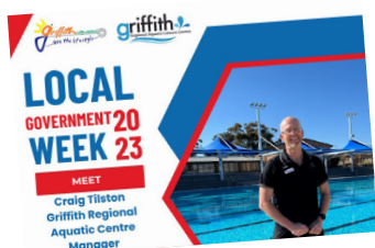
Meet The Team