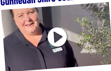
Meet The Team