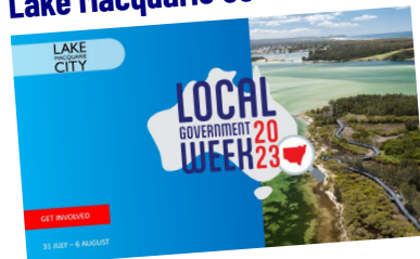
Did you know?